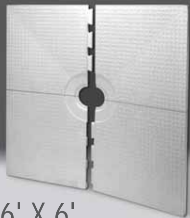
6' X 6' KERDI-SHOWER-ST

This new shower tray meets the increasing demand across North America, in both renovation and new home construction, for larger sized showers.